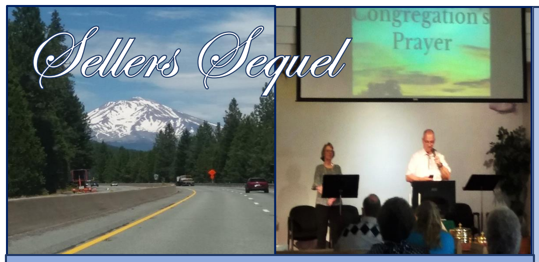
Reflections and Reconnections along the Road

Since we have been in the USA for the past five months and are far from our veranda in Yamoussoukro, our View from the Veranda is more like a View from our Vehicle, or some other mode of transport. Upon our arrival in the USA in June, we purchased our first personal car in the States in 34 years of marriage. And since then have put 17,500 miles on it, traveling in 31 states. In addition to driving across the country, we have also traveled to some places by plane, ship, train and bus. The views from our vehicle have been varied and vast-from the desert-scapes of Nevada to the breathtaking cliffs of the Oregon Coast. From the wheat-covered plains of Kansas to the glacier-covered mountains of coastal Alaska, we have found no lack of marvelous views to captivate our attention as we drive across the USA.