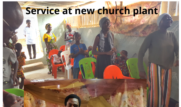
Service at new church plant