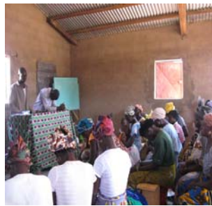
Prayer before Class begins .....