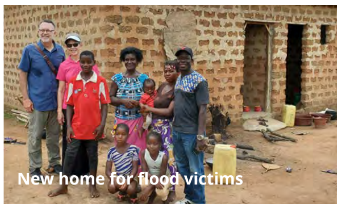
New home for flood victims