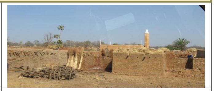
A typical Mossi Village - notice the mosque